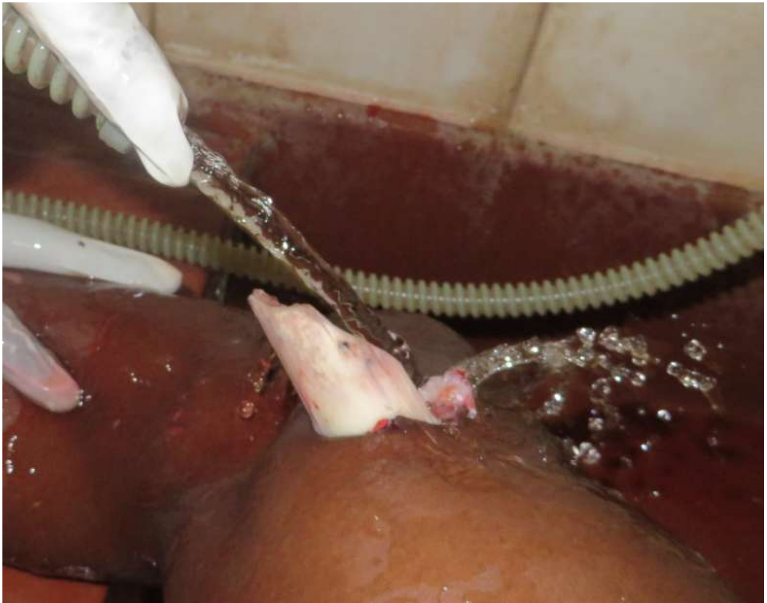
Irrigation of contaminated wound