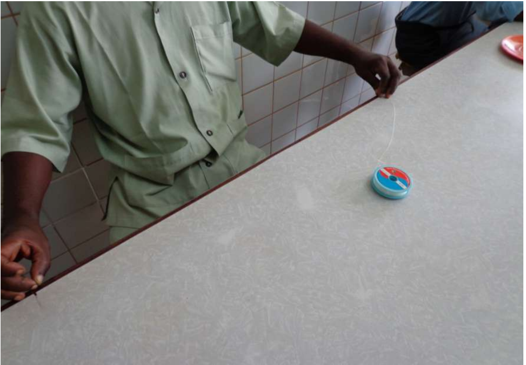
Preparation of nylon sutures from fishing line 4