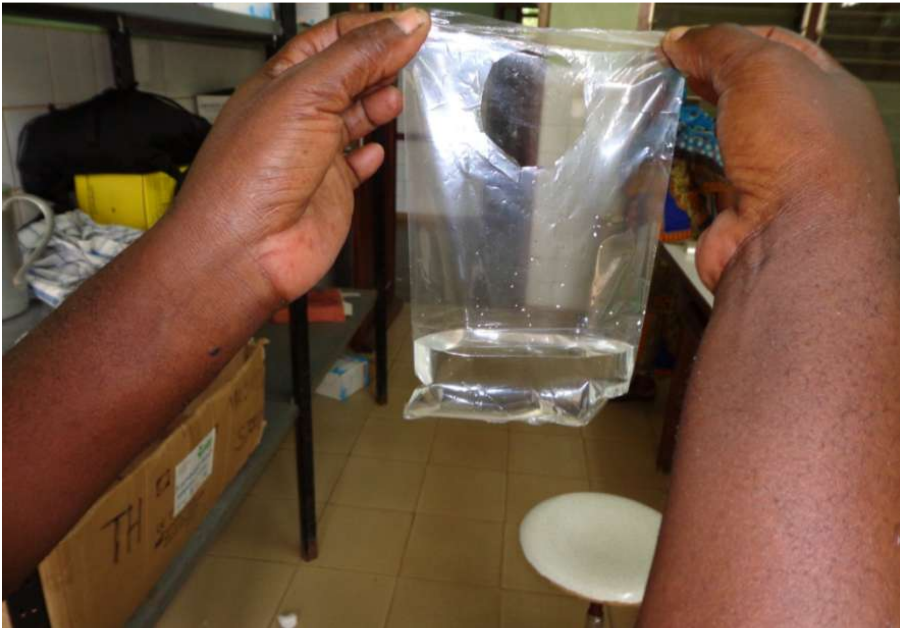
Preparation of colostomy bag