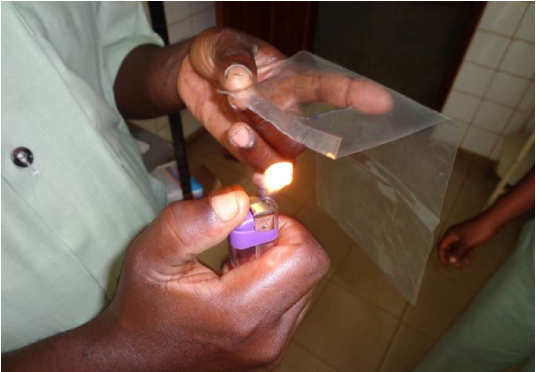
Preparation of colostomy bag