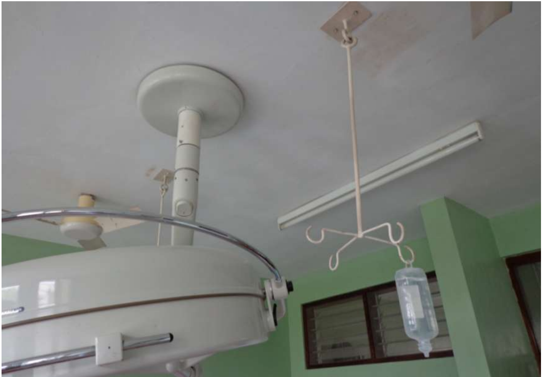
Hangers for IV fluids in Operation Room