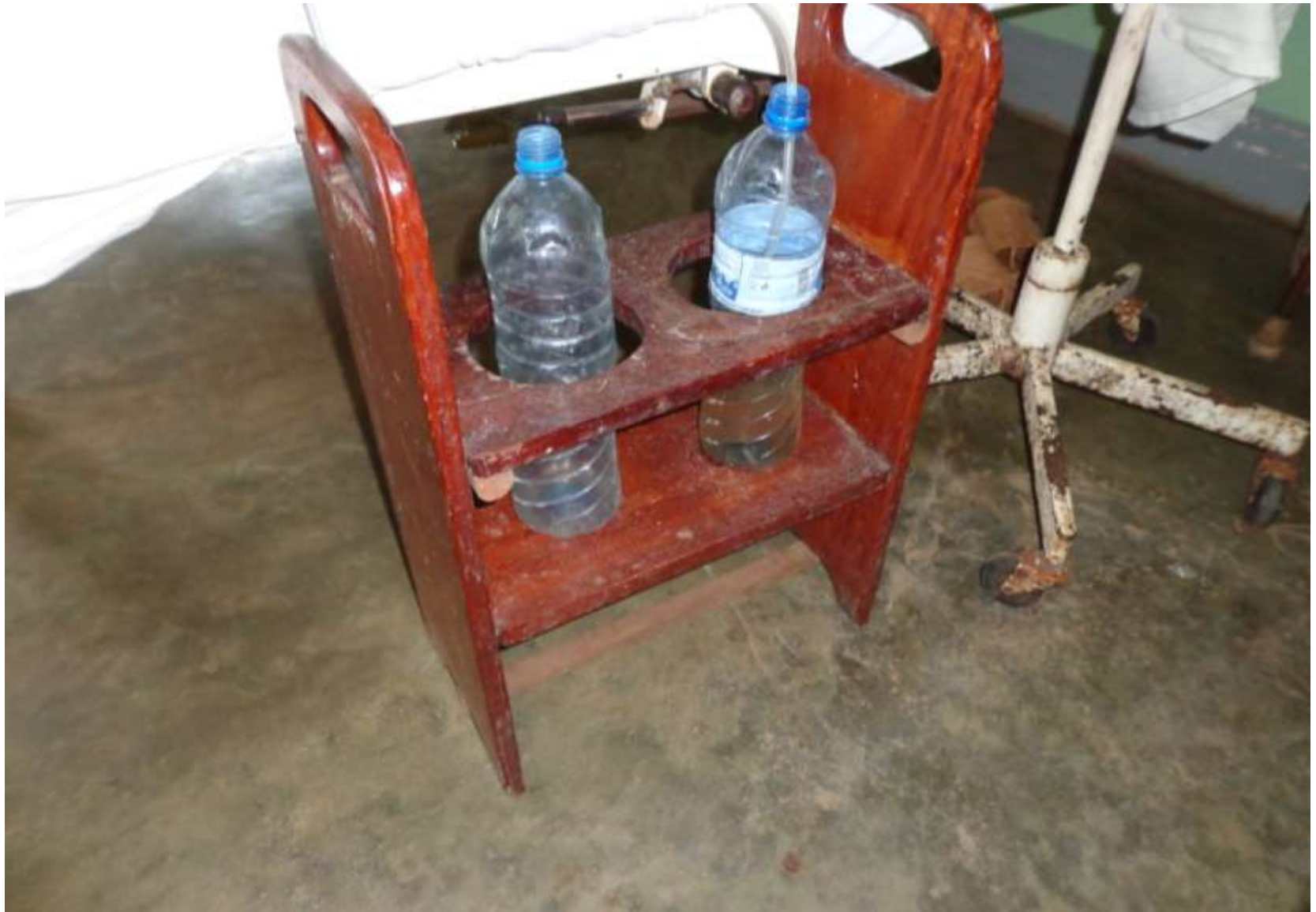
Wooden stand for bottles collecting urine