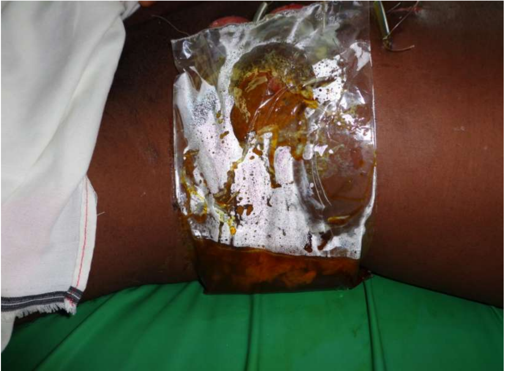
Colostomy bag in use