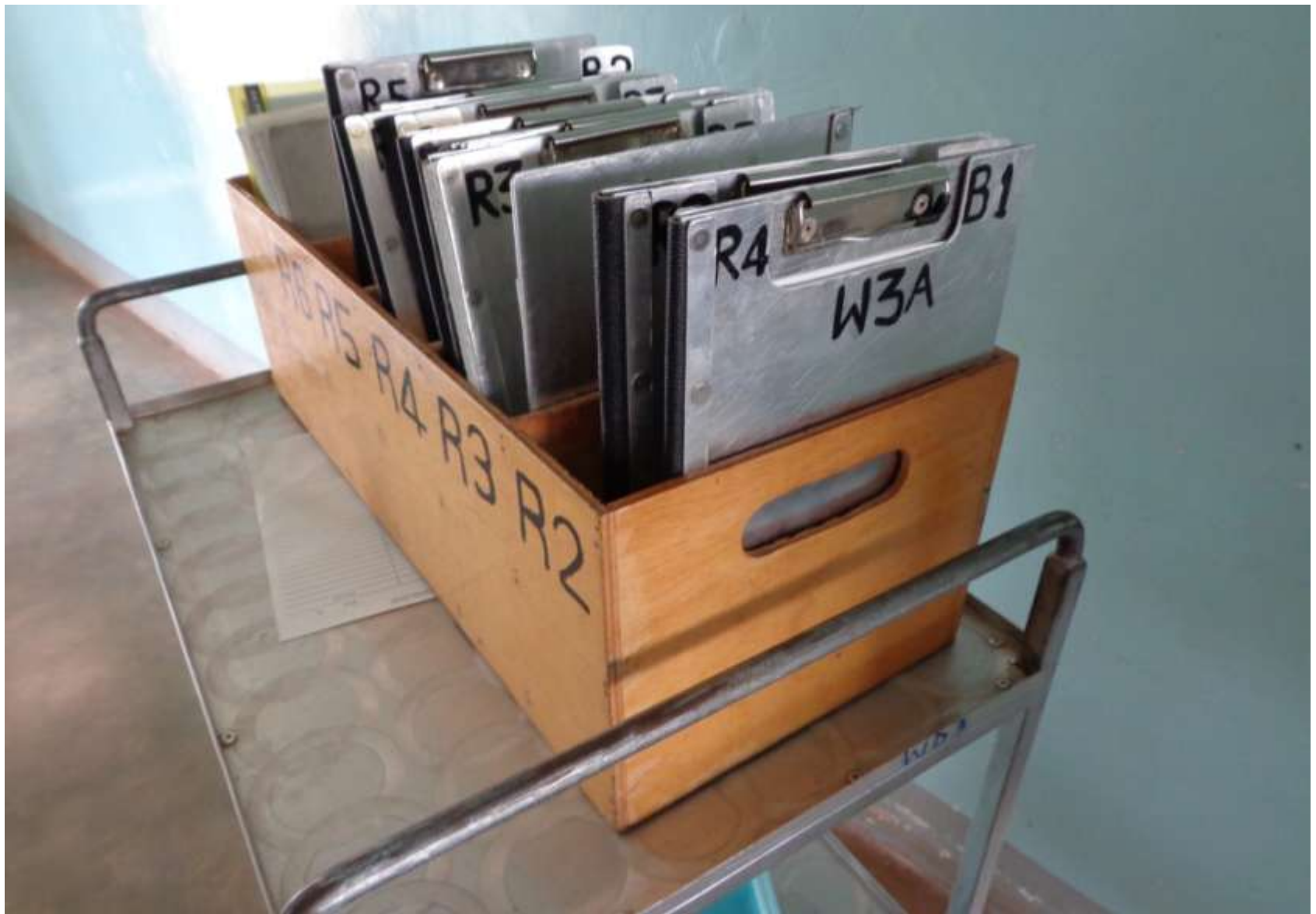
Trolley with boxes containing new aluminium clipboards for patient's files