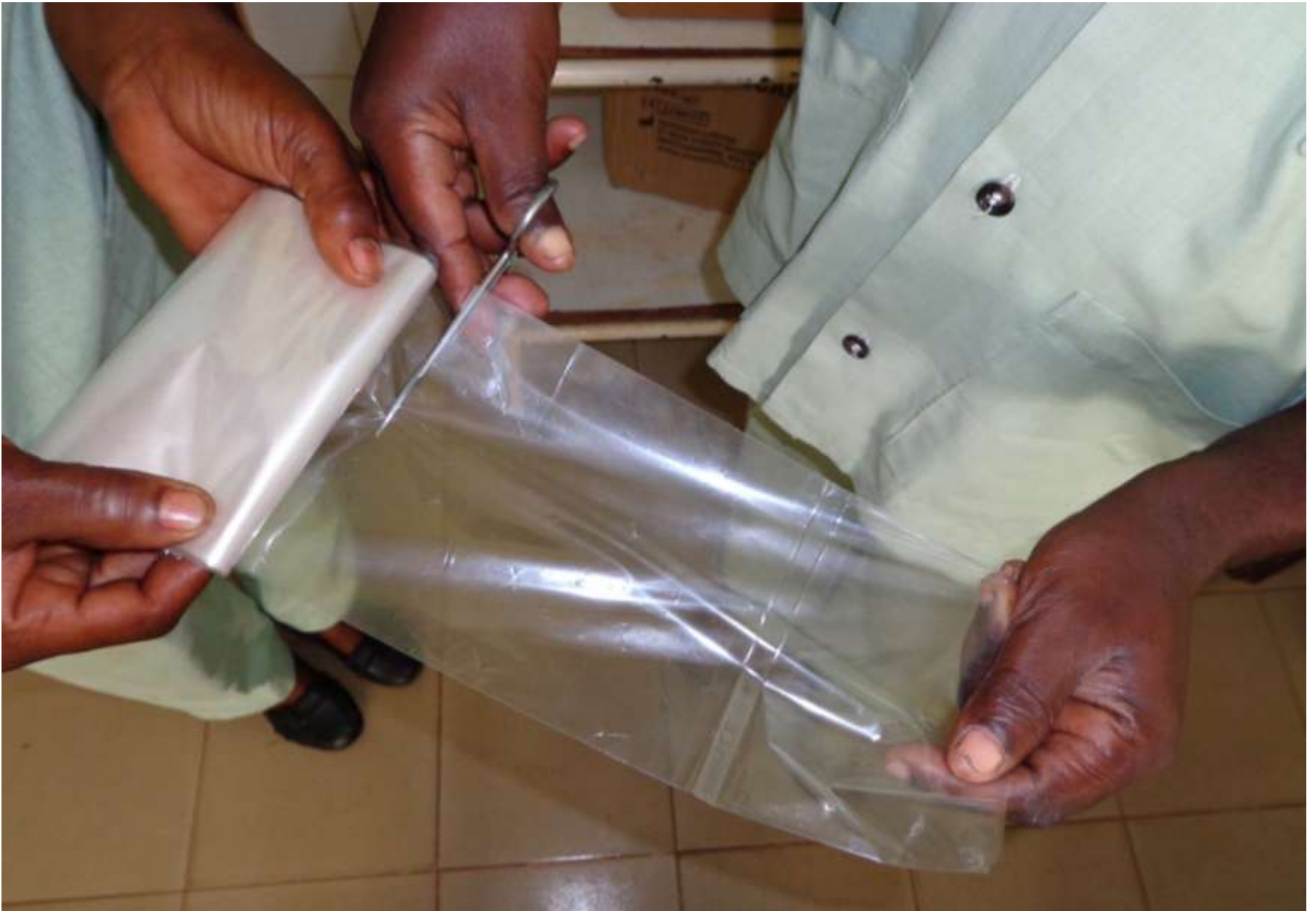
Preparation of colostomy bag