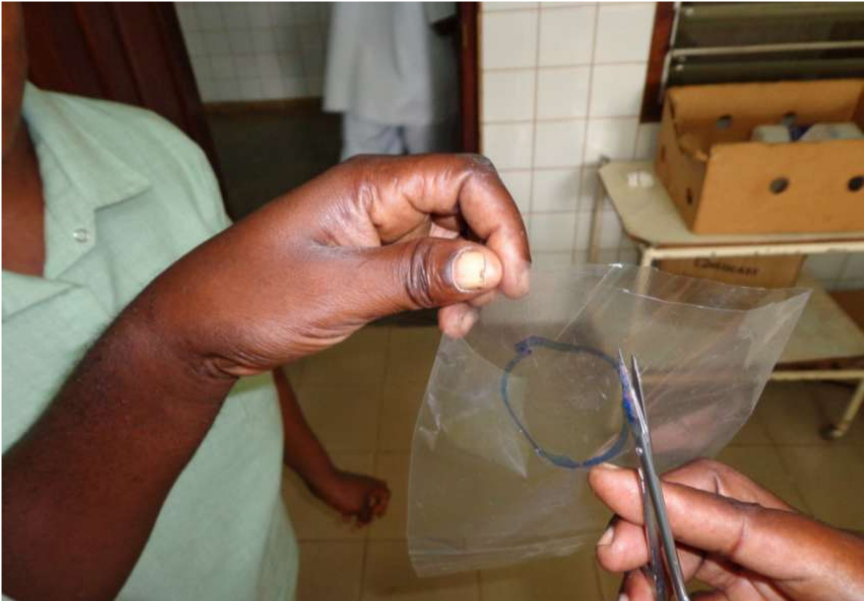
Preparation of colostomy bag