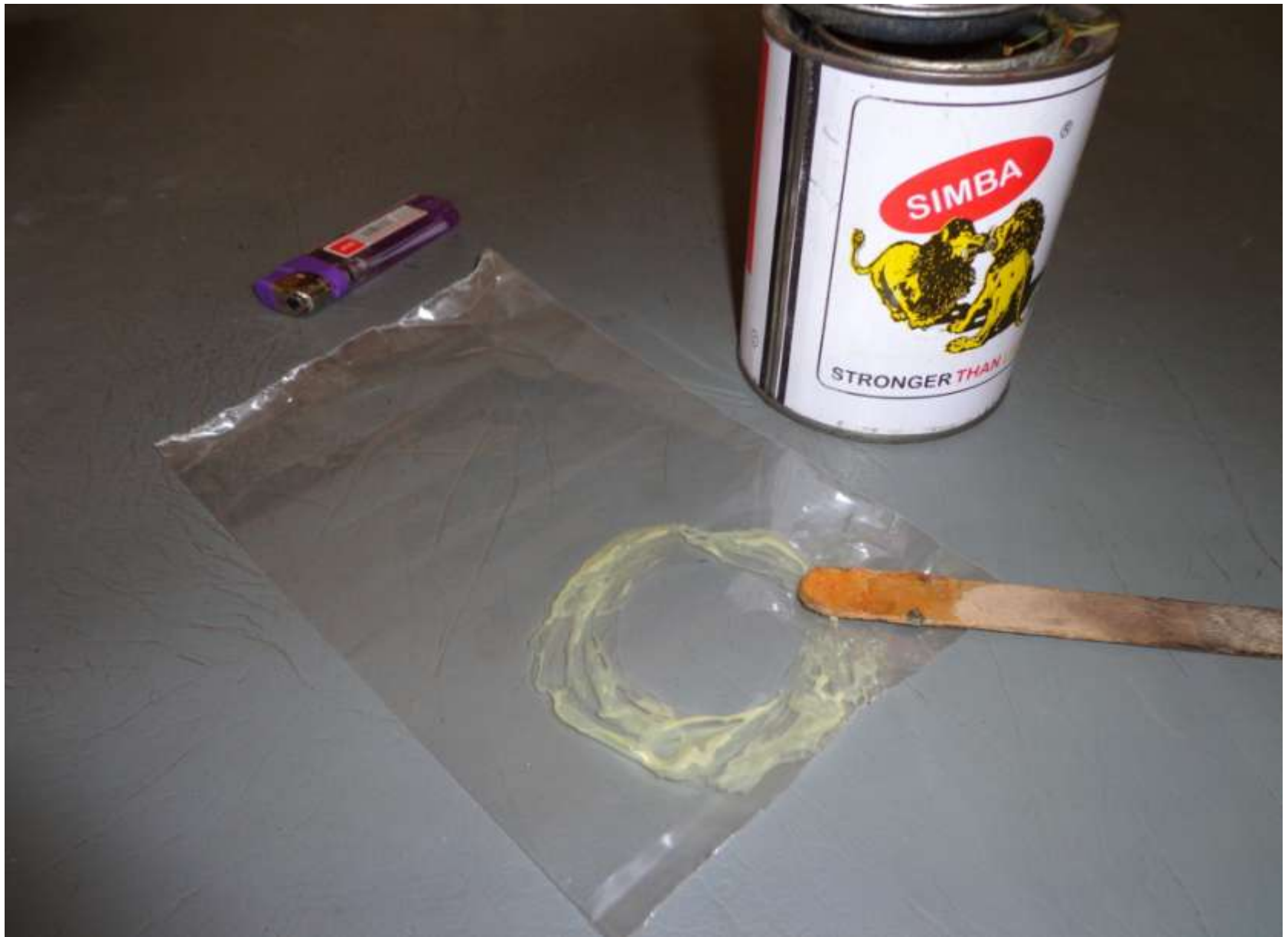
Preparation of colostomy bag