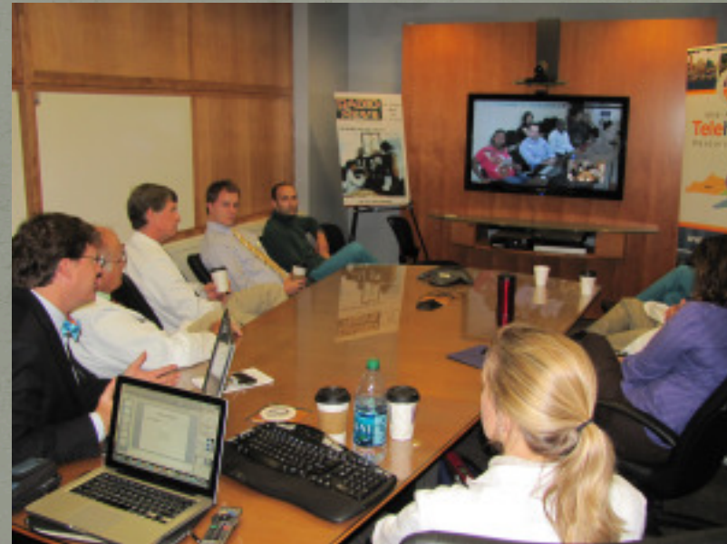
University of Virginia (UVA)