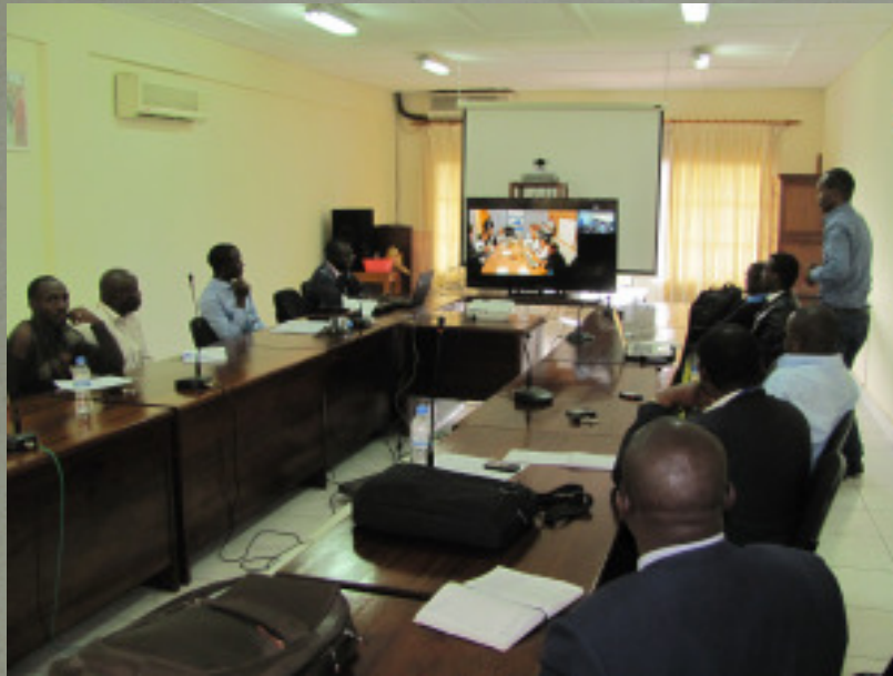
National University of Rwanda